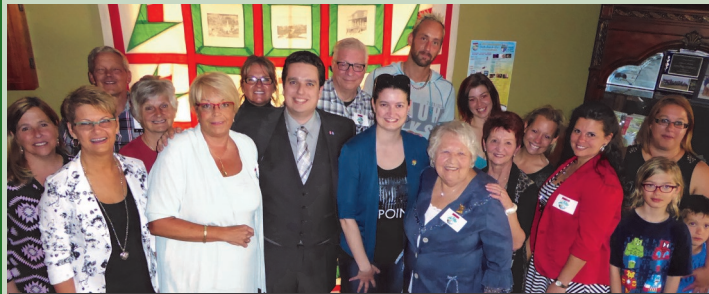
100 th Anniversary, Sainte-Anne-du-Lac, 2016 Community Anniversaries Program

The Government of Canada supports local cultural events and initiatives. The federal government is a partner in the renovation of Théâtre Le Patriote in Sainte-Agathe and the relocation of the Centre d'exposition de Mont-Laurier. Canadian Heritage supports the Festival des Arts de Saint-Sauveur; the Grande Traite des gosseux, conteux et patenteux in Nominique; Festi-Jazz Mont-Tremblant; the MRC des Laurentides's multicultural day; Festival 1001 Visages de la caricature in Val-David; and Canada Day celebrations (La Macaza, Arundel and Mont-Tremblant). Canadian Heritage has supported the programming at Théâtre du Marais in Val-Morin and Espace Théâtre Muni-Spec in Mont-Laurier, and it administers a community anniversaries program, which supports festivities to mark municipal anniversaries.