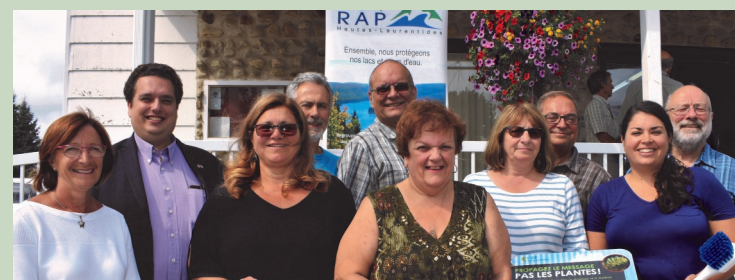
Grouping of Upper Laurentian lake and waterway associations (RAP-HL)