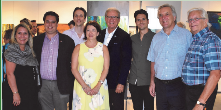
Festival des Arts de Saint-Sauveur Festival Support Program