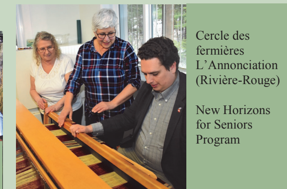
Cercle des fermières L'Annonciation (Rivière-Rouge) New Horizons for Seniors Program