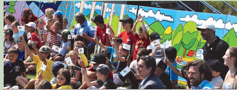
Mural by young artists, Mont-Tremblant Canada 150 Program