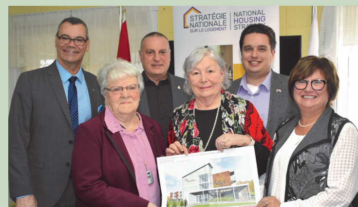
Villa-Cartier Project; Rivière-Rouge Social Housing Construction SHQ and CMHC — March 2019