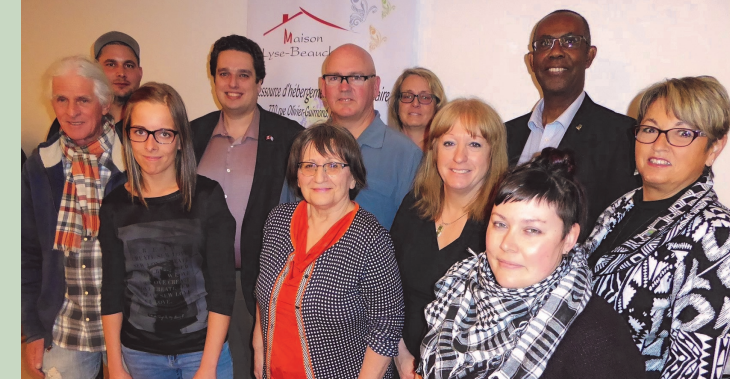
Maison Lyse-Beauchamp, Mont-Laurier and Ferme-Neuve Homelessness Partnering Strategy — March 2017