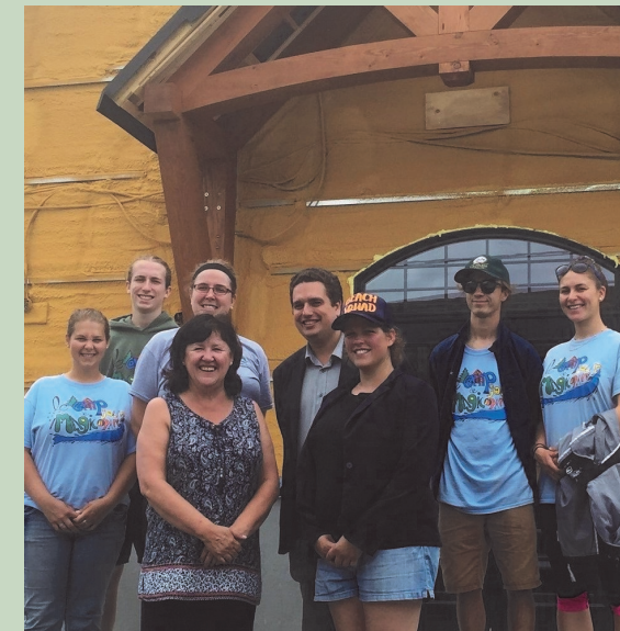
Sainte-Anne-des-Lacs Community Centre Upgrades CIP 150 — August 2017