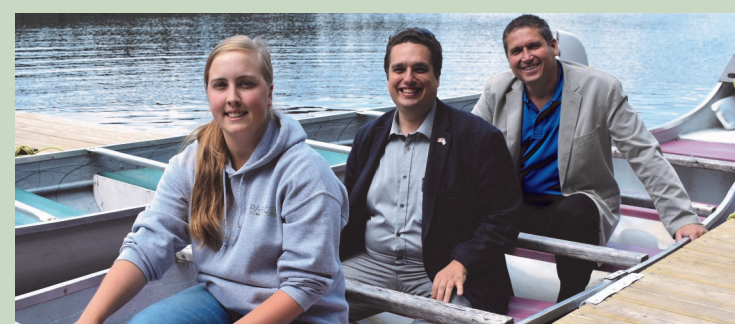
Saint-Faustin-Lac-Carré Parc Éco Tourisme Laurentides (CTEL) Facility Improvements; CIP 150 — August 2017