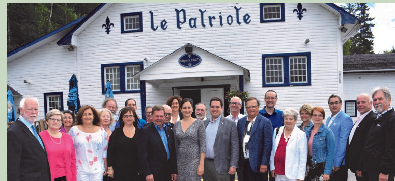
Théâtre Le Patriote; Sainte-Agathe-des-Monts Canada-Québec Small Communities Fund