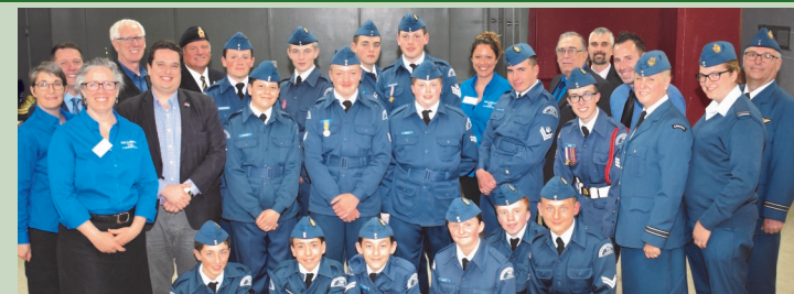
Mont-Tremblant Air Cadets— Squadron 716 Laurentien