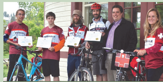
Le P'tit Train du Nord linear park