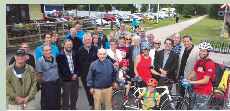
Le P'tit Train du Nord linear park Trail Work CIP 150 — September 2017