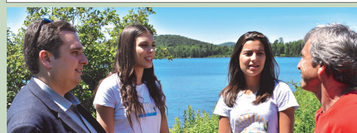
Lac Quenouille Owners' Association (Sainte-Agathe-des-Monts, Val-des-Lacs et Lac-Supérieur)