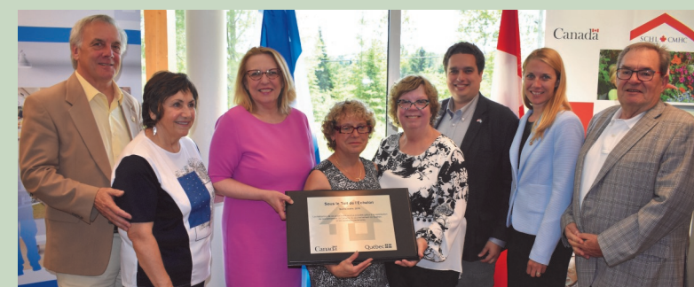
Sous le toit de l'Échelon; Sainte-Adèle Housing — Alternative Mental Health Resource Grand Opening — June 2018