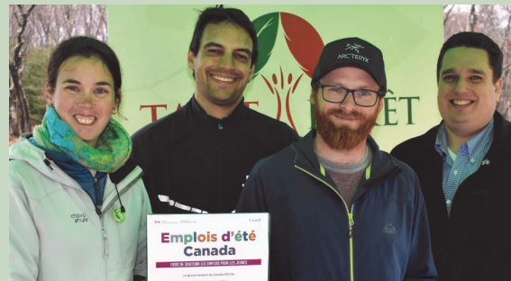
Table Forêt Laurentides

The Canada Summer Jobs program provides meaningful work experiences for young people aged 15 to 30, thanks to committed employers. In Laurentides—Labelle, three times as many youth jobs were supported in 2019 than in 2015. This summer, 236 jobs involving 210 projects are being supported by the Government of Canada (photos below: 2019 CSJ projects). Over four years, $2,32 million has been approved to help create more than 850 summer jobs for non-profit organizations, public agencies and private sector companies in the riding's 43 municipalities. We can see on the ground how much the program is appreciated and is benefiting our communities.