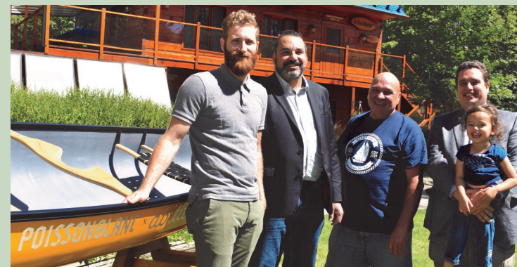
Notre-Dame-du-Laas Poisson Blanc Regional Park Facility Improvements; CIP 150 — August 2017