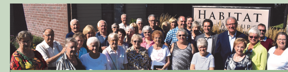
Habitat Saint-Sauveur: Reroofing work, CMHC program — fall 2017