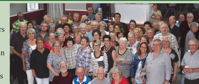
Club d'âge d'or de Val-Barrette (Lac-des-Écorces) New Horizons for Seniors Program