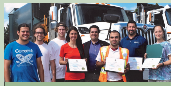
Régie Intermunicipale des Trois Lacs (RITL)