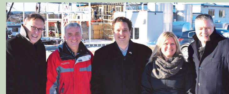
Laiterie des Trois Vallées; Mont-Laurier Productivity Improvement Program — January 2018