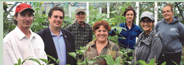
Cultiver pour nourrir community garden (AgriSpirit Fund) Food security roundtable of Antoine-Labelle

We are also a partner of Synergie économique Laurentides, whose dynamic team helps companies reduce waste and greenhouse gases (GHGs).