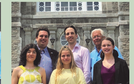
Festival des Arts Saint-Sauveur Saint-Sauveur Valley Chamber of commerce and tourism Laurentian Ski Museum