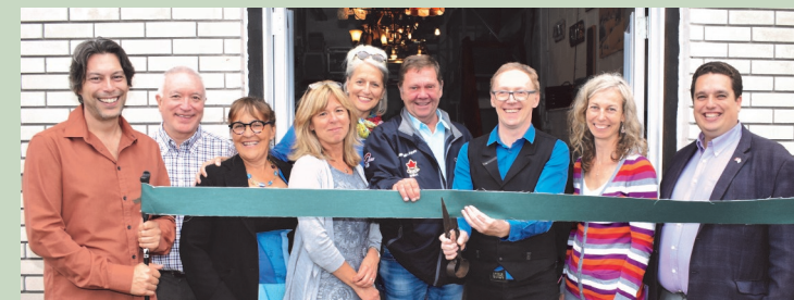
Inter Action Travail; Sainte-Agathe-des-Monts Skills Link Program — May 2018

Through Canada Economic Development (CED) and various federal programs, the Government of Canada supports local businesses and economic and social development.