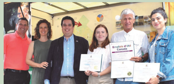
MRC des Laurentides — Employment Caravan