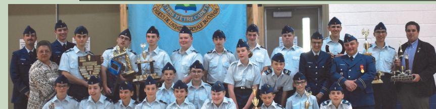
Mont-Laurier Air Cadets — Squadron 739 Vallée du Lièvre