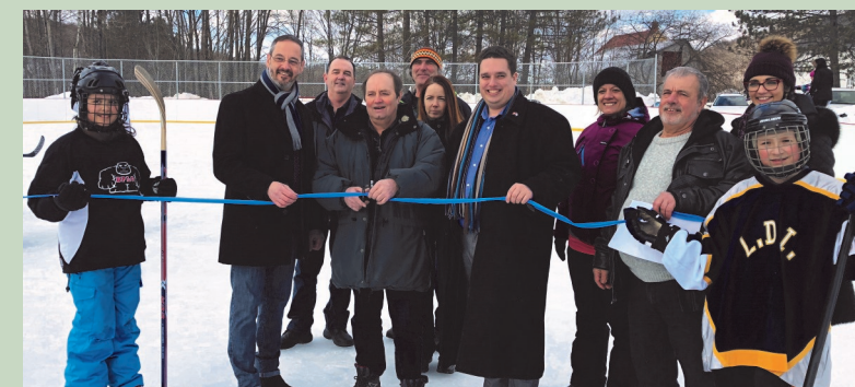
Saint-Aimé-du-Lac-des-Îles Multipurpose Outdoor Rink Canada-Québec Small Communities Fund— February 2018