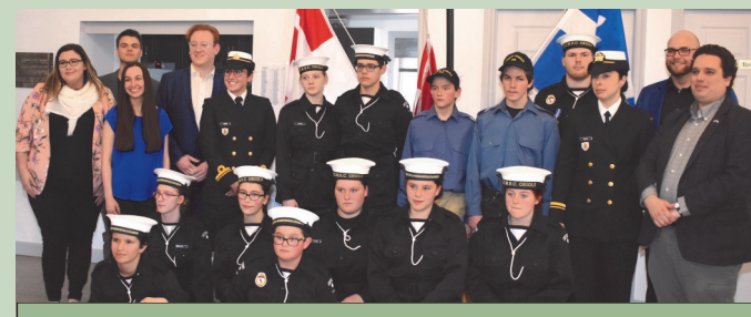
Notre-Dame-du-Laus Royal Canadian Sea Cadets Squadron 312 Oriole

Laurentides—Labelle is home to three cadet squadrons supported by federal program that fosters youth development and involvement across Canada. A big thank-you to the officers, parents and dedicated volunteers, and congratulations to current and former cadets!