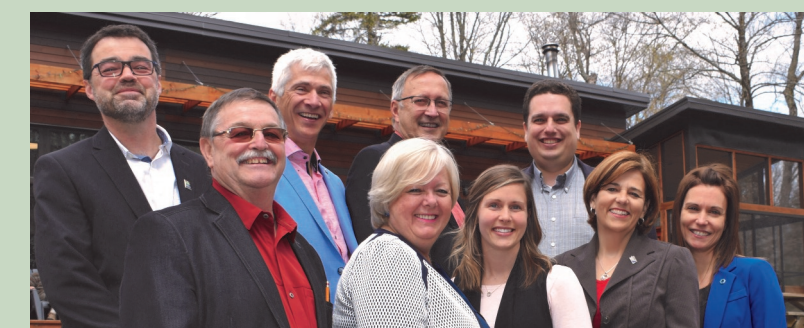
Montagne du Diable Park, Ferme-Neuve Expansion of Windigo sector— May 2019