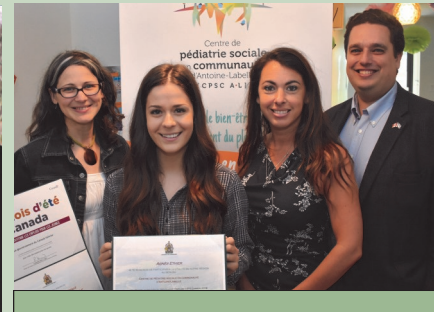
Centre de pédiatrie sociale en communauté d'Antoine-Labelle