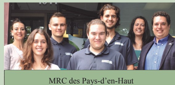
MRC des Pays-d'en-Haut Société plein air des Pays-d'en-Haut (SOPAIR)