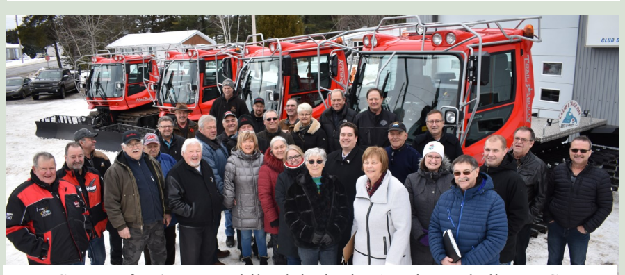
Support for 4 snowmobile clubs in the Antoine-Labelle MRC. December 15, Chute-Saint-Philippe

Parc régional de la Montagne du Diable, December 15, Ferme-Neuve