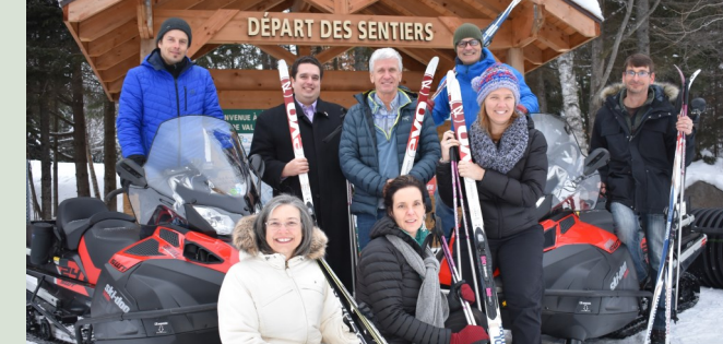
Val-David (Dufresne sector of the park) Société du parc régional Val-David/Val-Morin ( Far Hills sector of the park ) December 19. Val-Morin.