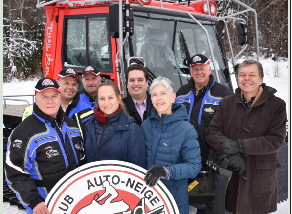
Club auto-neige Blizard, December 18, Sainte-Marguerite-du-Lac-Masson