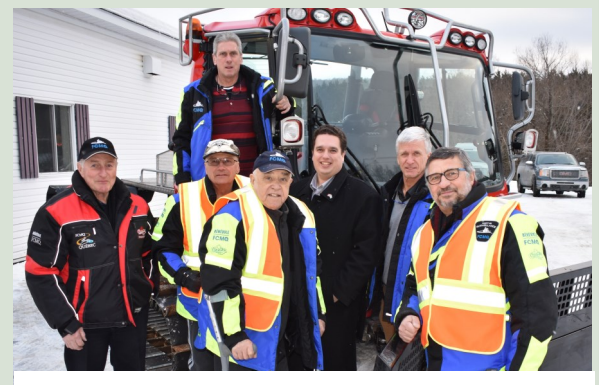
Club de motoneige Diable et Rouge, December 18, Brébeuf.