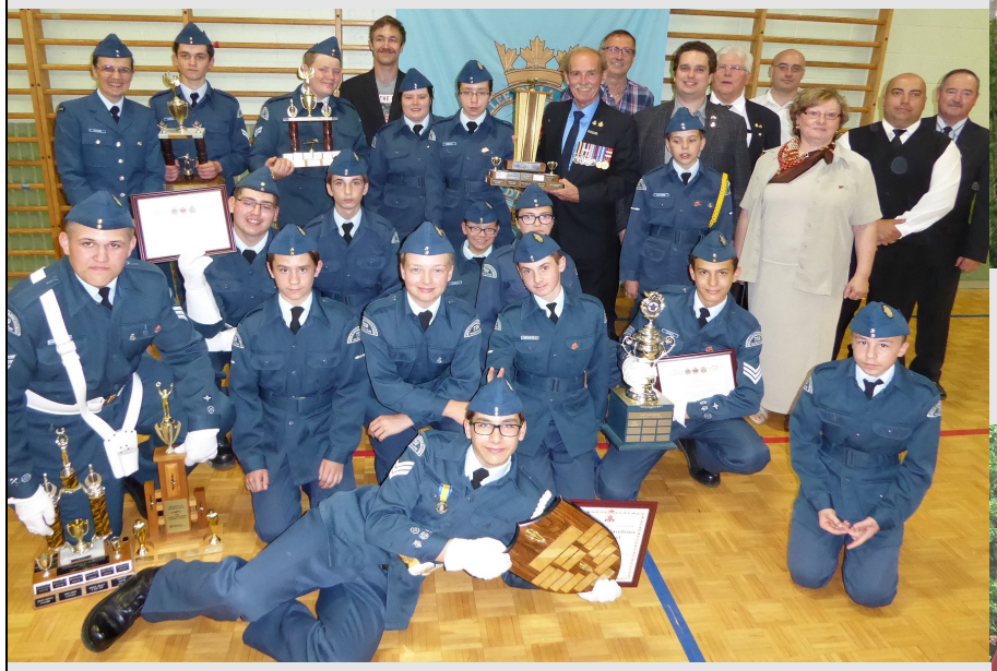
The Cadet movement instills interest in the aviation and aerospace sector for 12-18 year-olds, promotes physical aptitude, and contributes to the development of responsible citizens. On June 18<sup>th</sup>, the 739 Vallée de la Lièvre Air Cadet Squadron held their annual ceremony. Bravo to all the cadets and thank you to the adults that accompany them!

In order to prepare for their Remembrance Day ceremony, Secondary 5 students from Sainte-Agathe Academy visited the Canadian War Museum in Ottawa. It is always a privilege for me to have these conversations with our youth and I salute their initiative in honouring those who fought for our country.