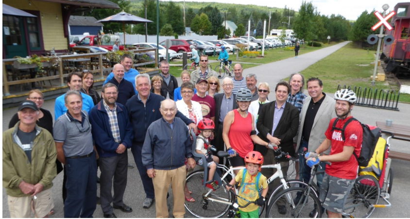
The railway right of way that Curé Labelle created became the linear park Le P'tit Train du Nord. On September 2<sup>nd</sup>, the federal government announced a $500,000 subsidy to support regional efforts to repair the park, treasured by the local population and by tourists from around the world.

It is no secret that, aside from a growing tech sector in the south and forestry and agriculture in the north, tourism is the engine for much of the region's economy. Proper Internet access and cellphone service and the health of our lakes are important issues to deal with to ensure the continued survival of this crucial industry, as is working for improvements to our employment insurance system and the infrastructure required to gain access to our region. Highway 15, as someone in Sainte-Adèle put it to me recently, helped us open up the region, but it is now choking us, with serious traffic congestion. So what is our long term solution? The answer remains to be worked out and your participation, by sending me your thoughts, comments, and ideas, will help us get there.