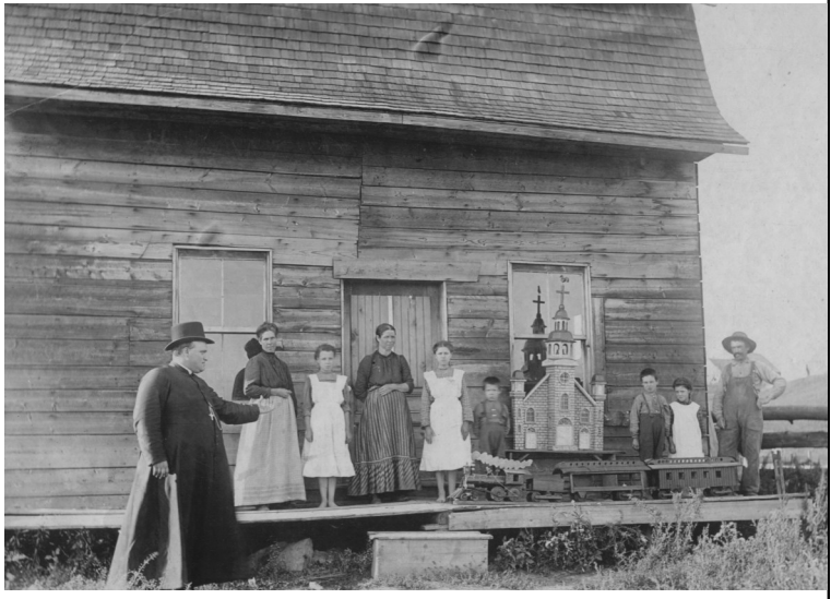
This archival photo is a conversation piece. There is no consensus on its authenticity or its origin. The image shows Curé Labelle met by a family of colonists with a mock-up of a church and a train. If you have any details..

Saint-Jérôme. With the few dollars he earned, he could buy essential tools. Labelle saw the