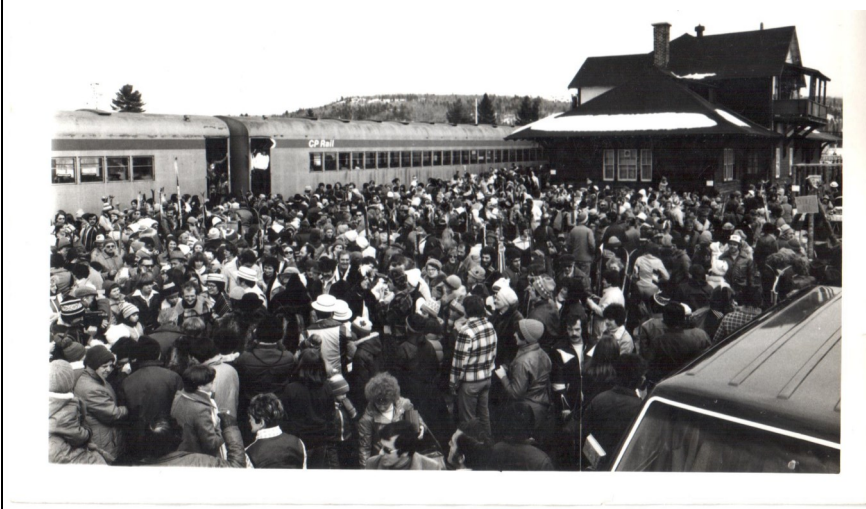
Among the last passenger trains, this chartered train came to Labelle in 1978 and was greeted by more than 1,200 people under the theme Curé Labelle: 100 years later.